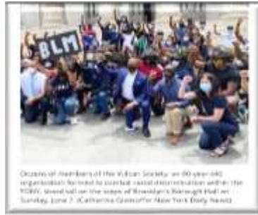
Dozens of members of the African Society, an 80-year-old organization founded to combat racial discrimination within the FDNY, stood tall on the steps of Rensselaer Borough Hall on Sunday, June 7.